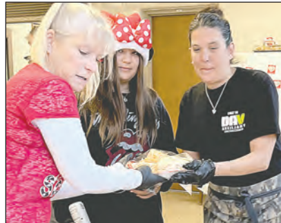
Volunteers are key to the annual free Christmas dinner at Zion Lutheran Church in Cloquet.