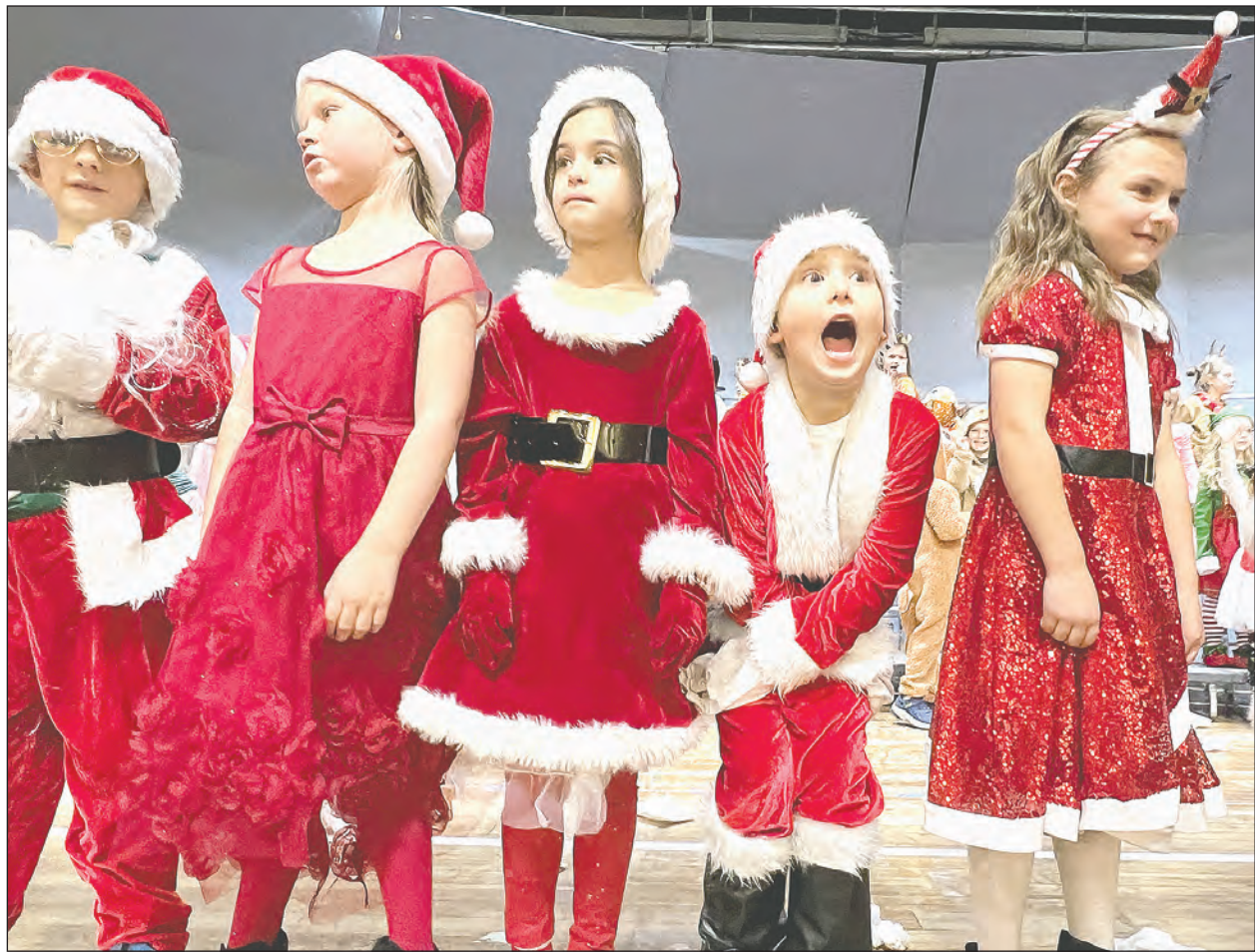
Focus is not the mission of these Esko kindergarten students, who are between songs and dressed in their best Santa outfits for the Christmas program on Friday, Dec. 13. Soon enough they were singing their hearts out and all facing the same direction – toward an audience of adults who were thrilled with the performance. Students pictured with permission, but the school asked not to use names. Check out this year's Letters to Santa in the North Pole News, starting on Page 11.